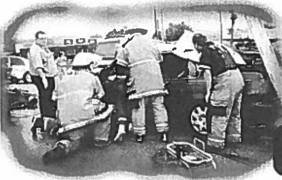
Delay is deadly! Always call 911 right away!!