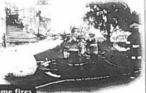
Never go back into the house or burning building - no matter what!