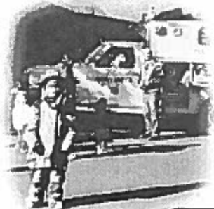
Most fatal home fires happen at night.