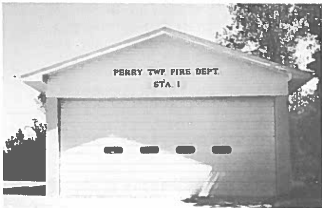
STATION 1 JOHNSON LANE AND BROADWAY