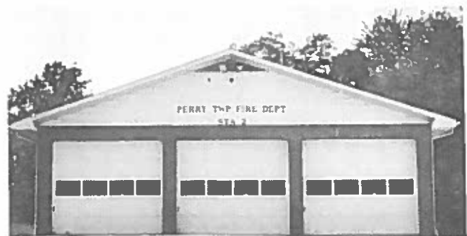
STATION 2 11 S. WILLIAMS ROAD

Due to many responses to our questionnaire in our last newsletter, we are showing a picture with the address of each fire station. That tells us you do read them and we would like to thank you.